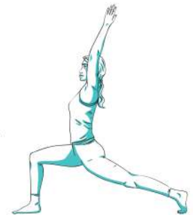
3 High Lunge