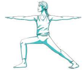
4 Warrior II