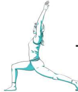
3 High Lunge