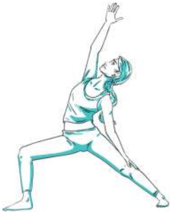
5 Reverse Warrior