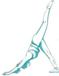
2 Three Legged Dog