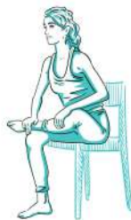
12 Seated Pigeon