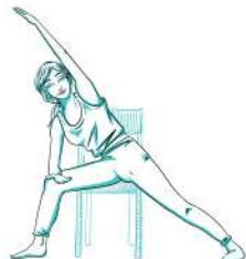
16 Chair Side Angle