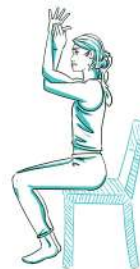
13 Seated Eagle