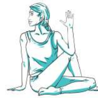
9 Seated Twist