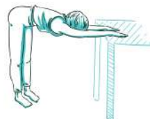
17 Chair/Table Down Dog