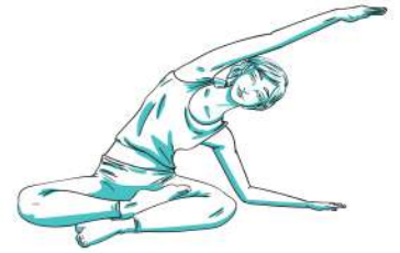
3 Seated Side Bend (both sides)