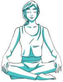
1 Easy Seat