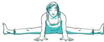
8 Wide Legged Fold