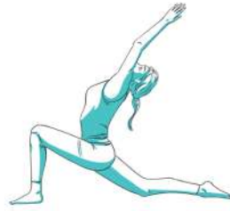
9 Crescent Lunge