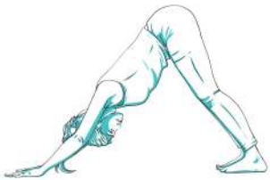
1 Down Dog