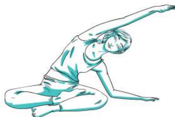
9 Seated Side Stretch